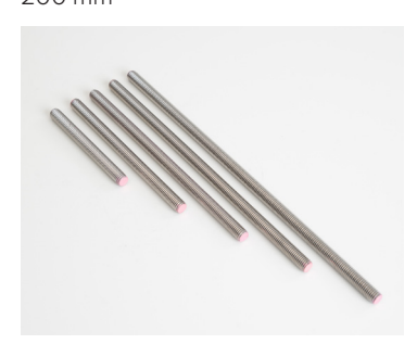
Threaded Rod SS 200 M10 threaded stud 304SS 200 mm