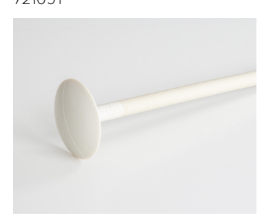
Nylon Mushroom Bolt 300 Bolt mushroom head M16x300mm 72109T