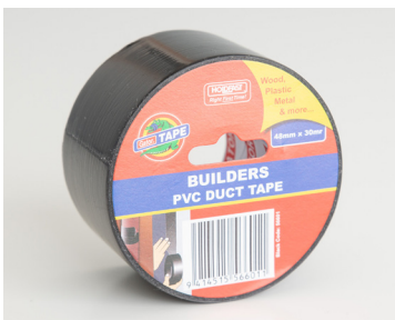
Tape Black Tape black pvc duct 48mm x 30mtrs 56601