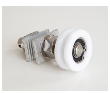
Nylon Wheel Axle Large Nylon wheel 55x16mm ID c/w axle SS