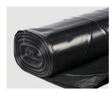
Black Polythene Black polythene