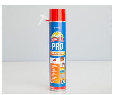
Foam Large Expanding foam DIY Gorilla 750ml 20048