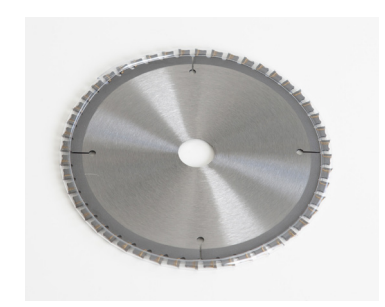
Small Circular Blade Blade 150x22mm bore small circular