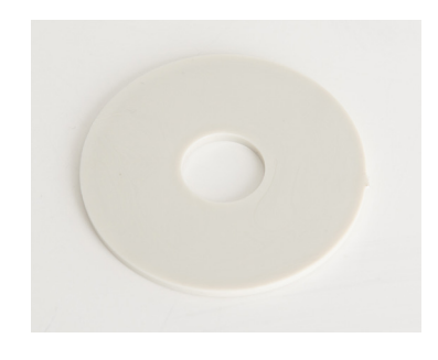
Pennywasher SS Pennywasher M10x32 mm SS 10X32X1.5