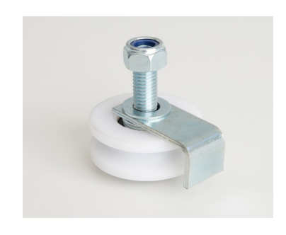
Wheel Large Tandem Wheel large tandem LH/RH DBHR5 MF SS-MET