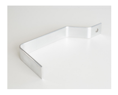
Door Closer Door closer IRBNT-1120-BSE