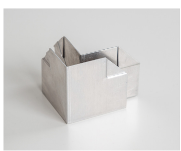
Corner Cap Corner cap alu mill CC4040 int./ ext.