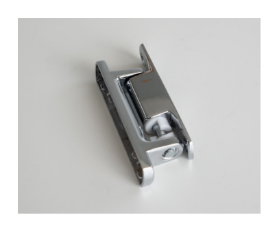
Floor Guide SS Floor guide SS 100x100mm FG1860