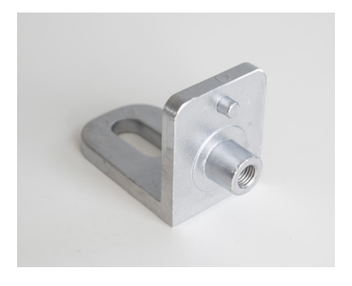
Hasp Hasp mill LH940MF