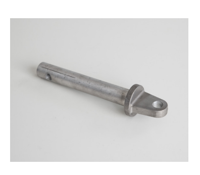
Release Pin Release pin RPO MFO