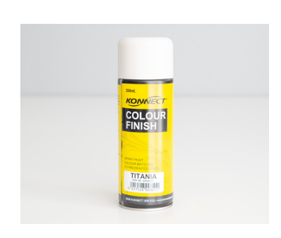
Paint Aerosol Aerosol paint Titania 350ml