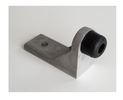
Floor mounted Door Stop STPL Floor door stop large LFS184MF