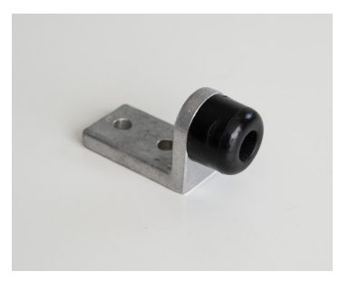
Floor MT Door Stop STPS Floor mounted door stop small SS 2070 MF