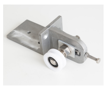
Wheel Large Wheel hanger large RH/LH LDHR 55 MF SS-MET