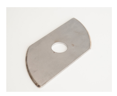
Flail Blade Panel cutting blade flail